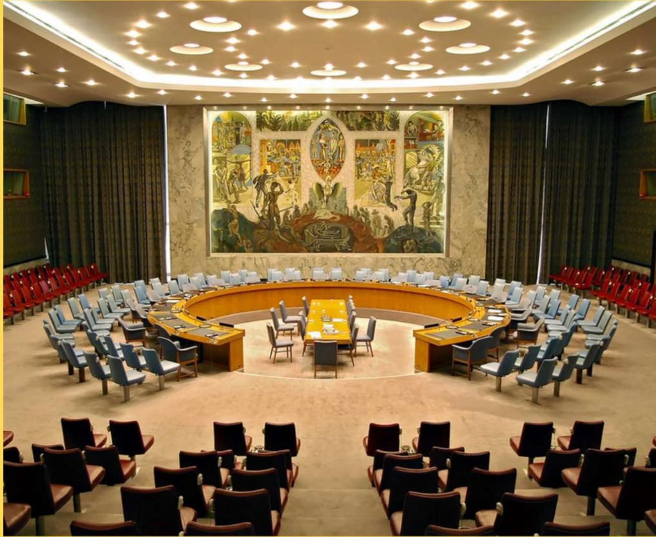
UNITED NATIONS SECURITY COUNCIL