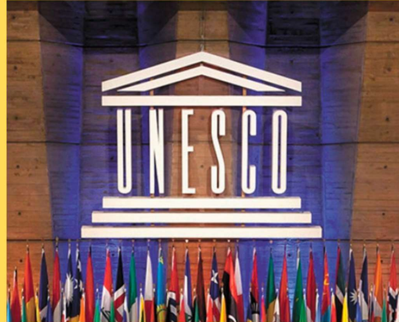
UNITED NATIONS EDUCATIONAL SCIENTIFIC AND CULTURAL ORGANIZATION

UNESCO or United Nations Educational Scientific and Cultural Organization, specialized agency of the United Nations that was chartered in a constitution, was signed on November 16, 1945 . The constitution, which entered into force in 1946 , has the main tenacity to promote international collaboration in the field of Education, Science and Culture. The organization's headquarters are in Paris, France. UNESCO has 195 member states and ten associate members. Most of its field offices are 'cluster' offices, covering three or more countries; national and regional offices also exist. UNESCO's activities have been primarily facilitative, intended at assisting, supporting, and supplementing the national efforts of member states to eradicate illiteracy and to expand the access of education.