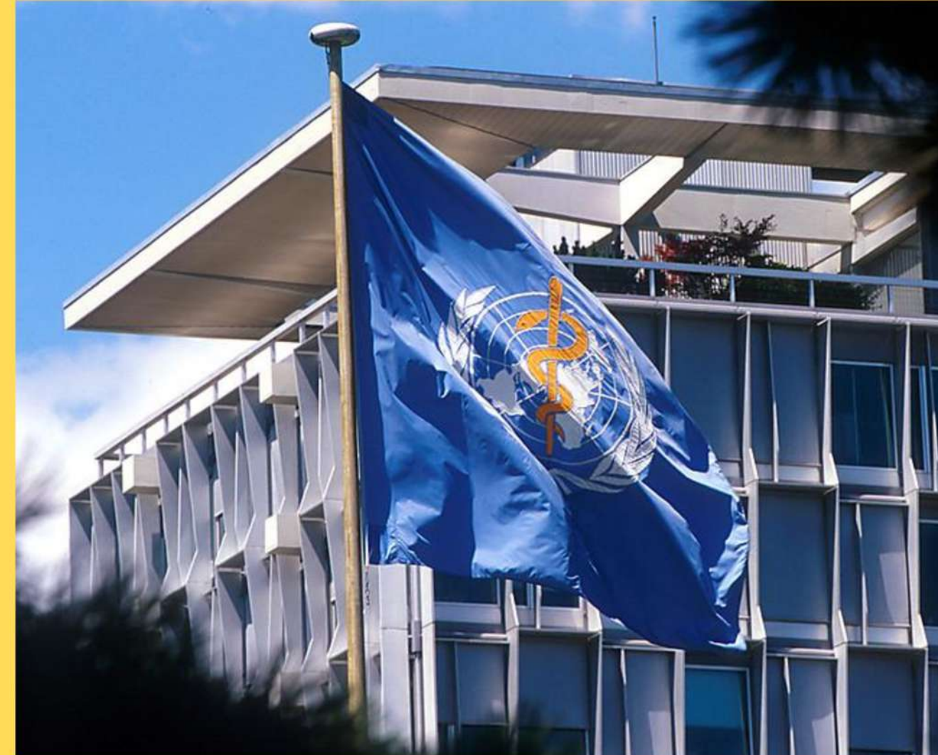
WORLD HEALTH ORGANIZATION

World Health Organization ( WHO ) is a specialized agency of the United Nations concerned with International Public Health. Its primary role is to direct and coordinate international health within the United Nations system. Its main areas of work are health systems , health through the life-course, non communicable and communicable diseases, preparedness, surveillance and response, and corporate services.