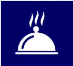
DIPLOMATIC / GALA DINNER

Diplomatic or Gala Dinner will be held during the closing ceremony. It's a perfect event to network with the other participants and enjoy the meals in a luxurious hotel.